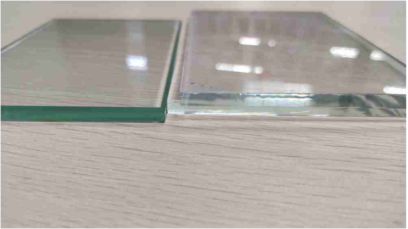
Low iron glass vs clear glass