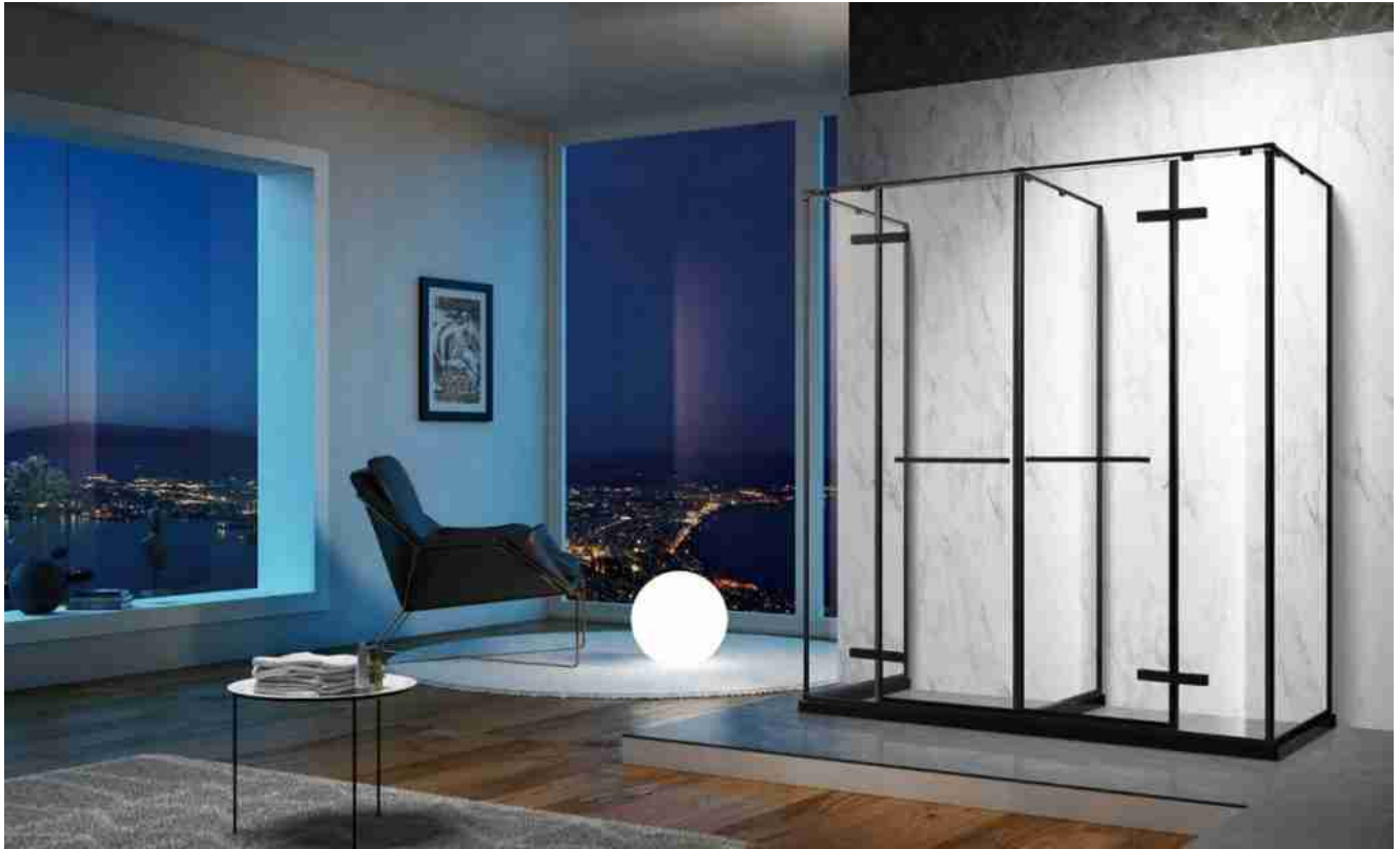
Good design spacey sense low iron glass shower door.