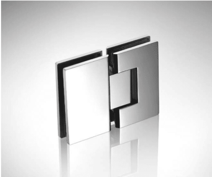
Shower door hinges