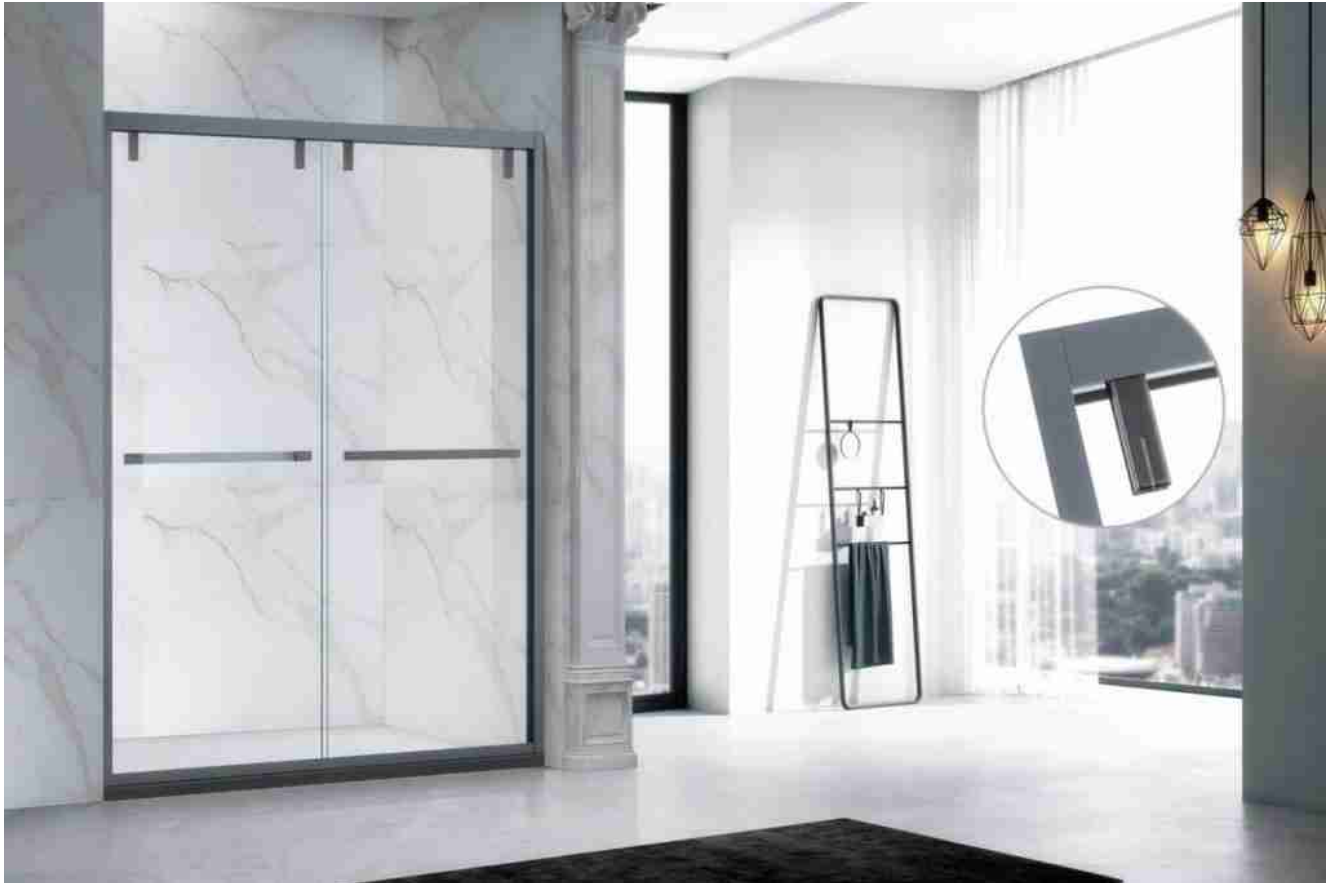
Super elegant sliding low iron glass shower door

Several low iron sliding glass shower doors are here for your reference: