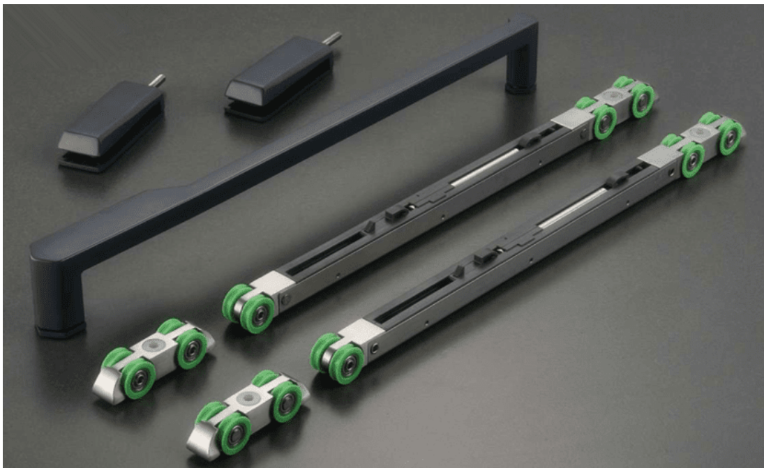
Shower door sliding accessories