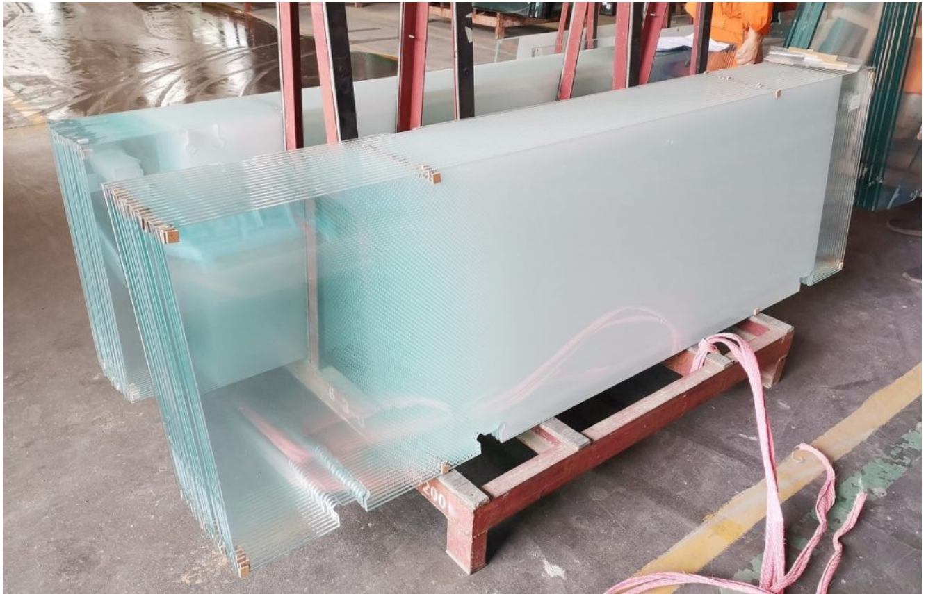
ceramic frit glass showerscreen

etc. All according to your designs. A very highly recommended design.