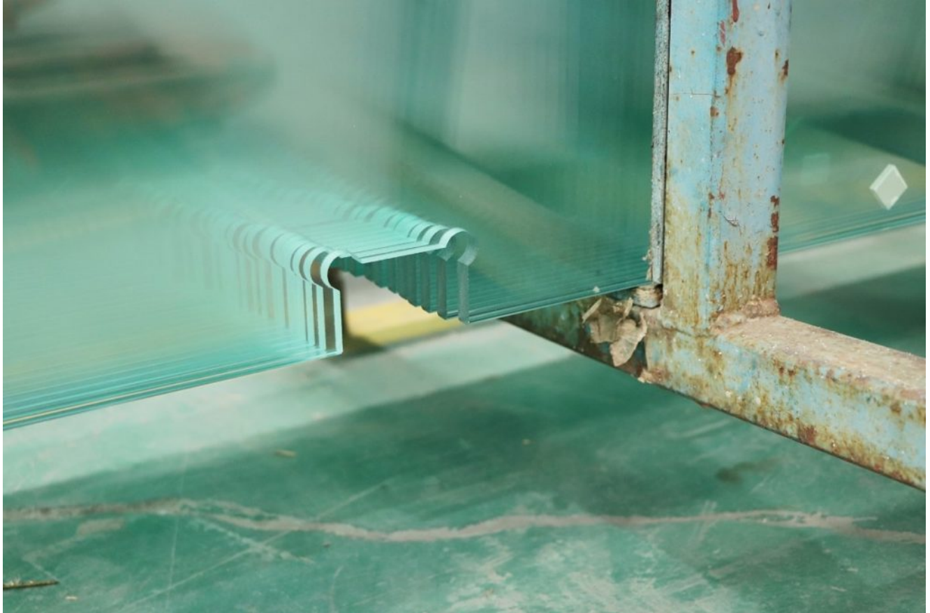
monolithic shower enclosure glass

The key point for this type of shower glass would be controlling the tempered glass quality which is detailed described in another article. In the meantime, tempered glass distortion also should be paid attention to as it will influence the visual esthetic feelings. Tempered glass distortion should be controlled on a minimized scale.