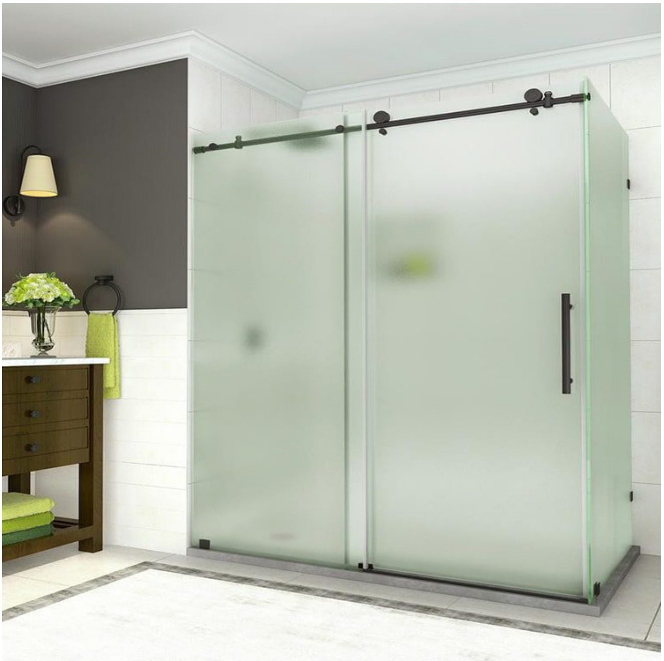
Frosted opaque glass shower screen

If you have a good budget allowance, acid etched glass is no doubt preferred for obscure satin designs!