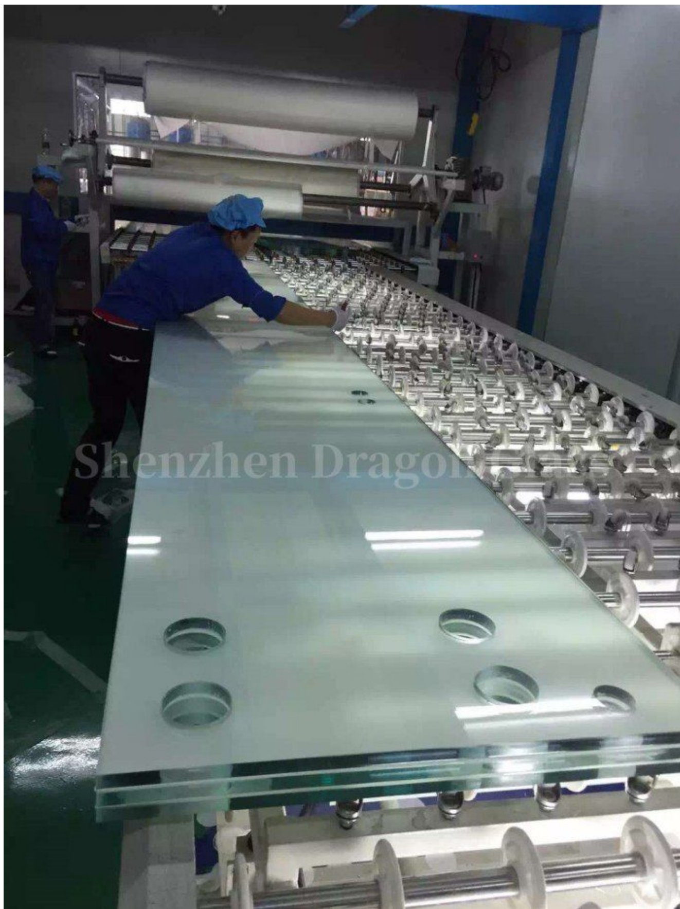
bulletproof glass doors

ask any questions or discuss our products further.