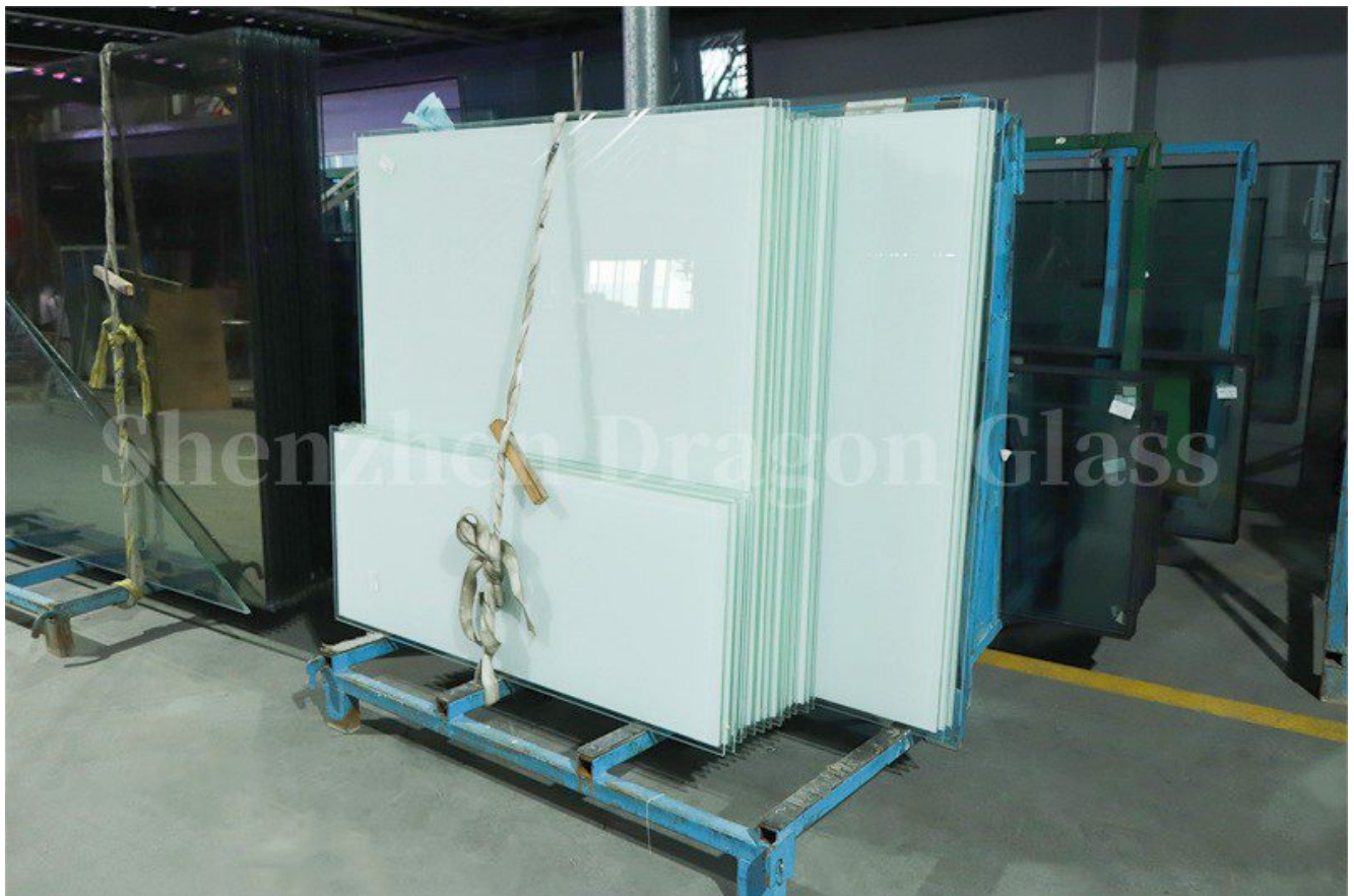
bulletproof glass windows

Besides impact resistance, we provide superior protection as well as full transparency for simple viewing. Additionally, our glasses feature a unique internal film matrix that greatly promises both UV protection and thermal insulation capabilities and ensures that they can perform in the most extreme and demanding situations. For customers looking for the highest level of protection and performance, look no further than us!