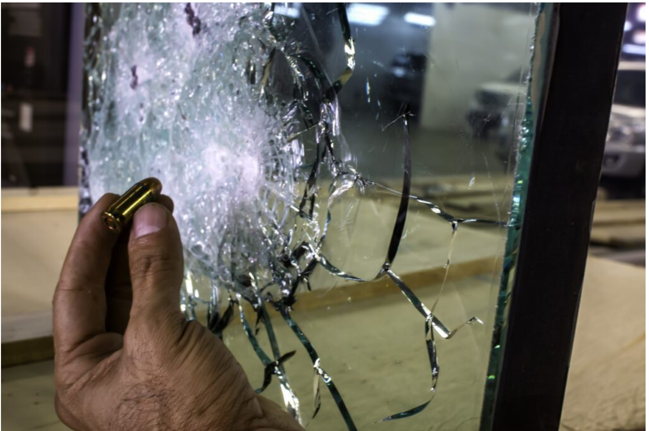
bulletproof glass windows

Bulletproof glass has a rating system that indicates its level of bullet resistance; this rating ranges from Level 1 up to Level 8. In any case, bulletproof glass does an excellent job of stopping most types of small arms fire and it has become an important tool for those wishing to protect their property and assets from outside threats.