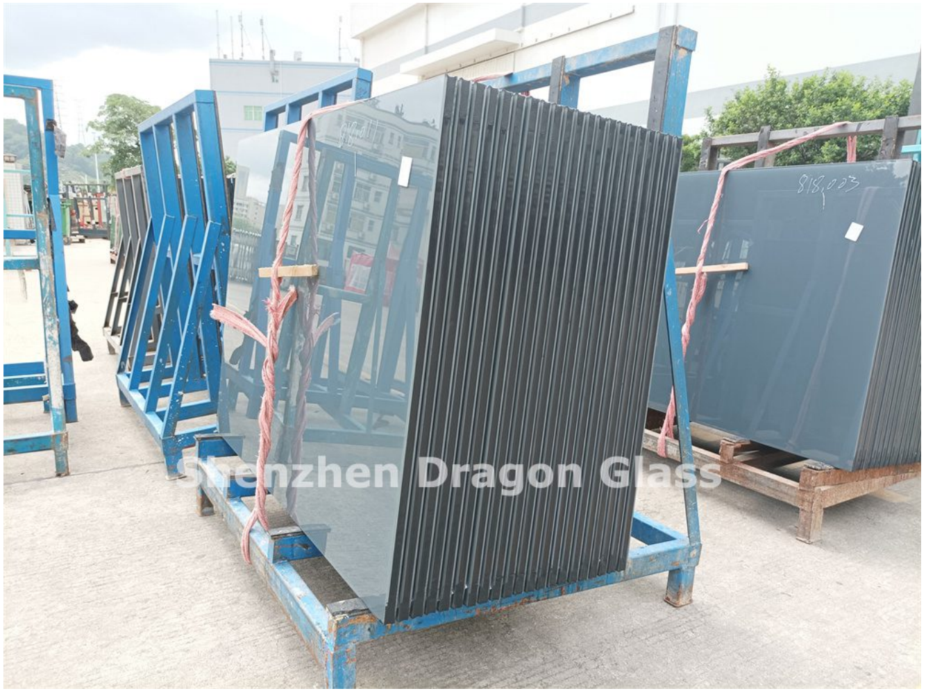
double glazed low e glass