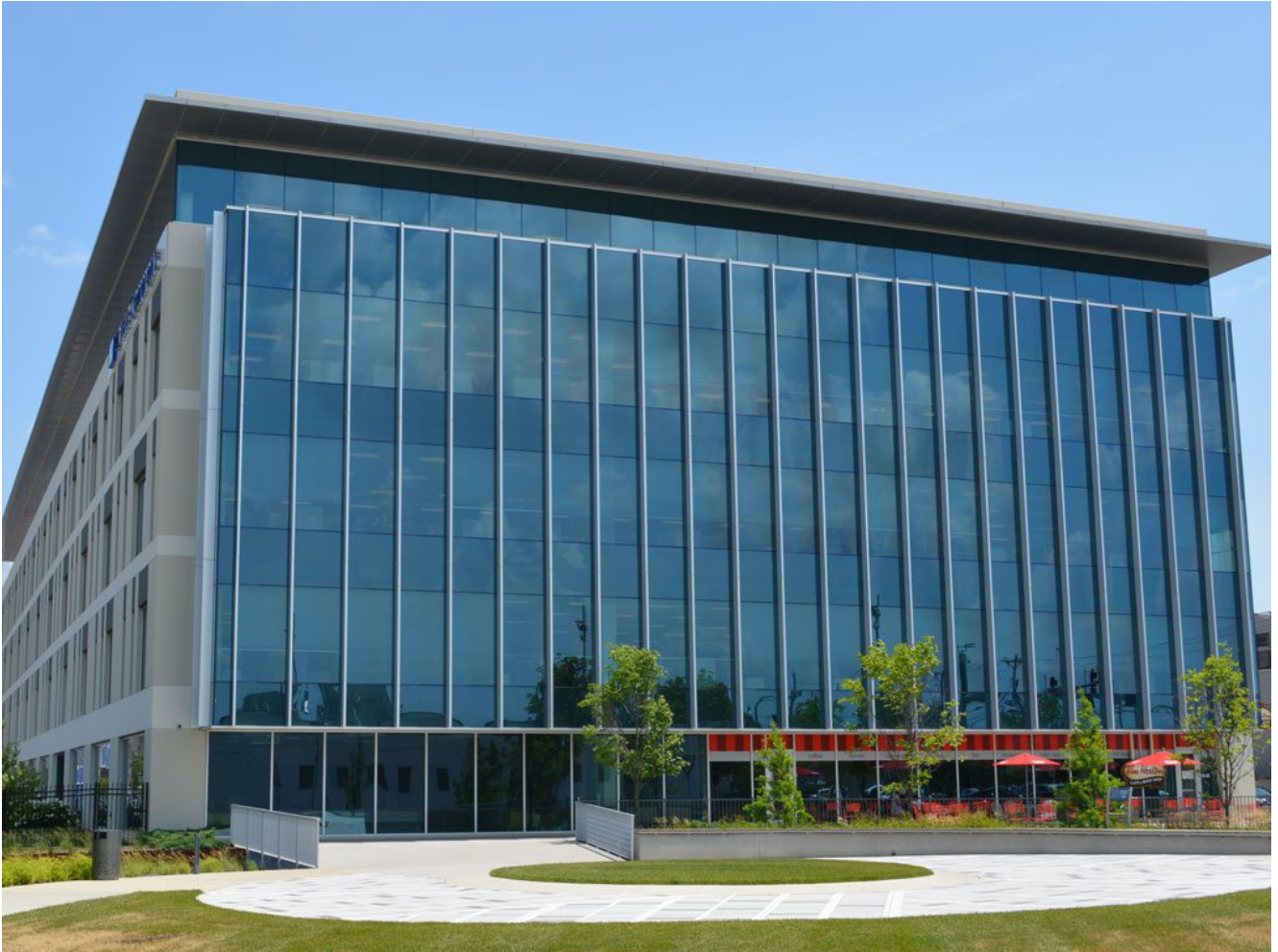
low e insulated glass curtain wall