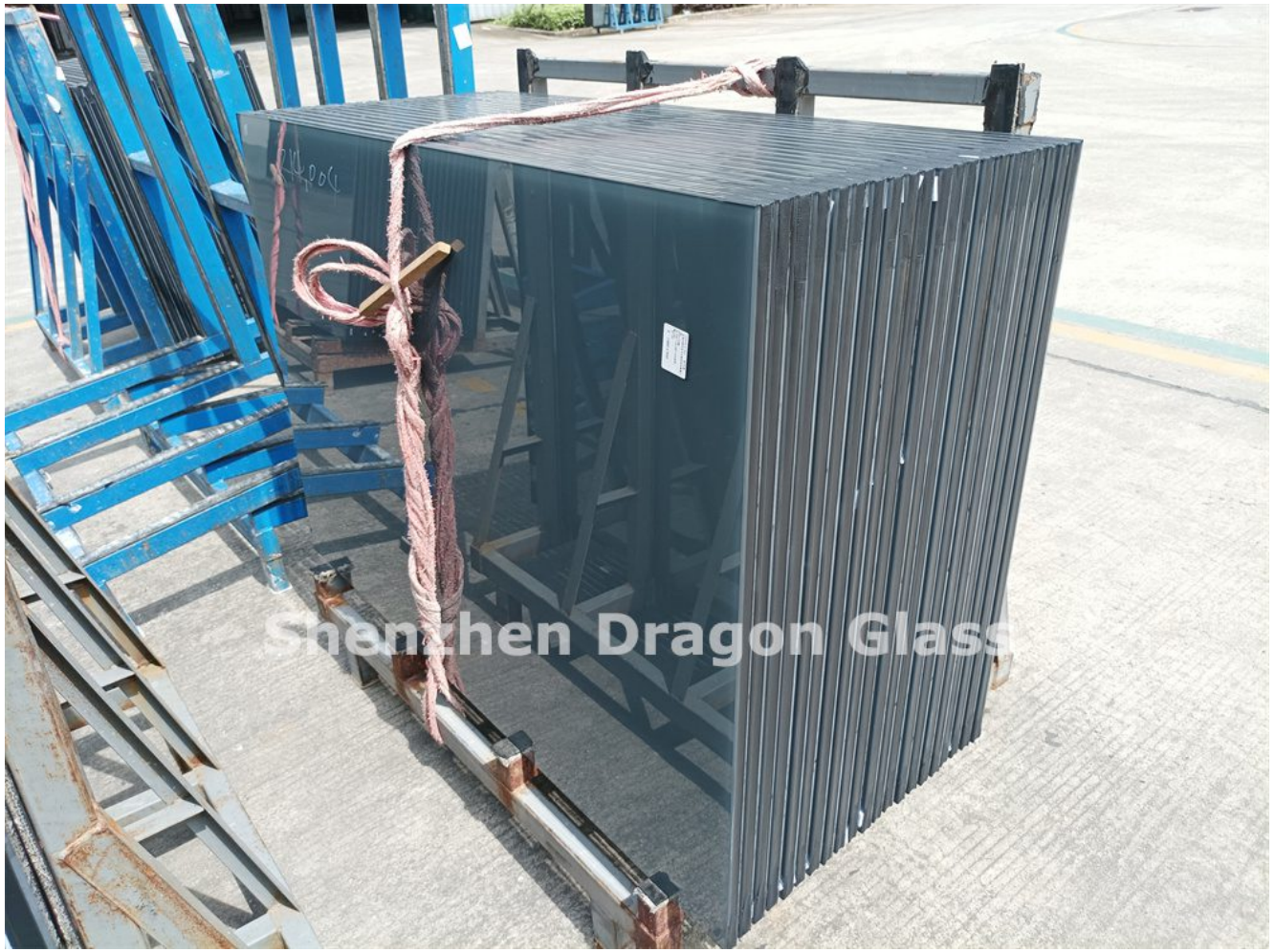
insulated spandrel glass