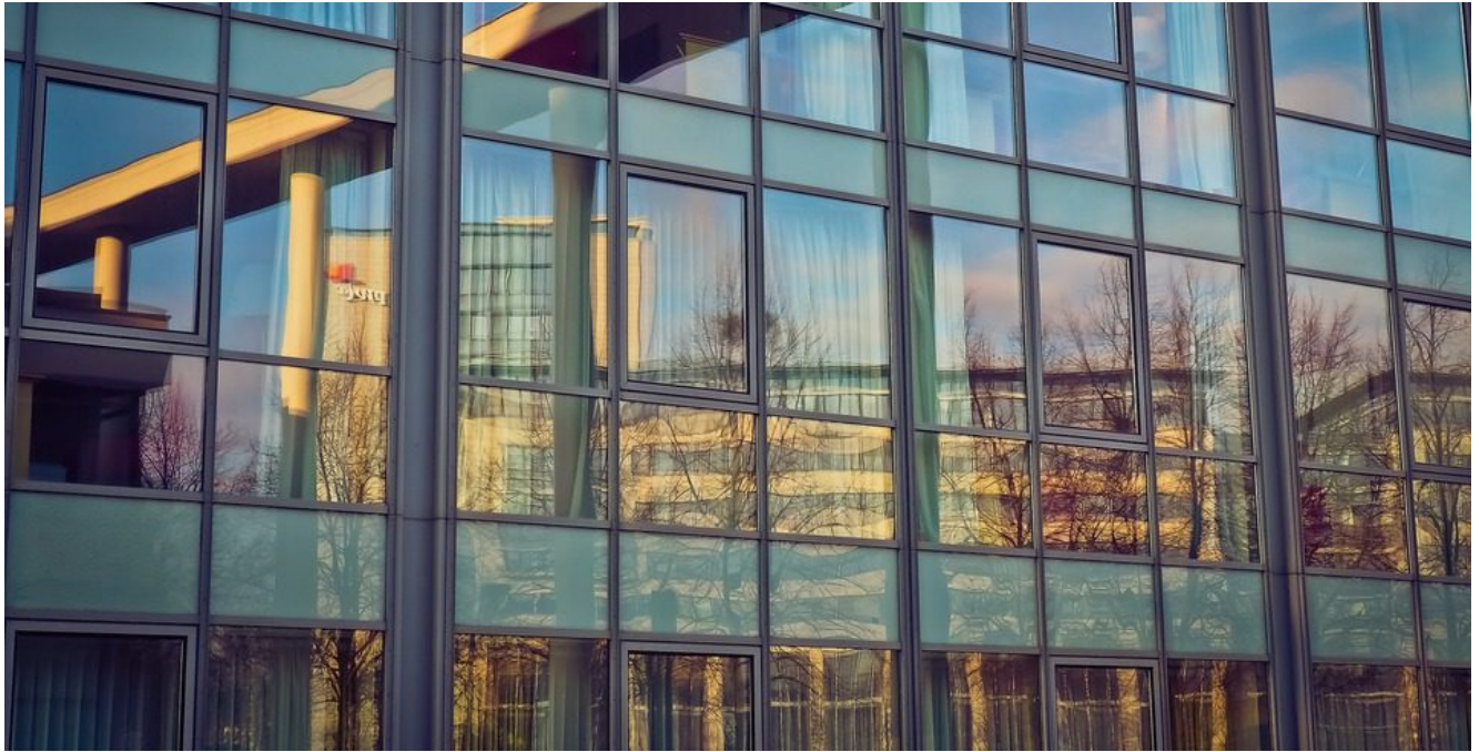
insulated spandrel panels between two floors of a building