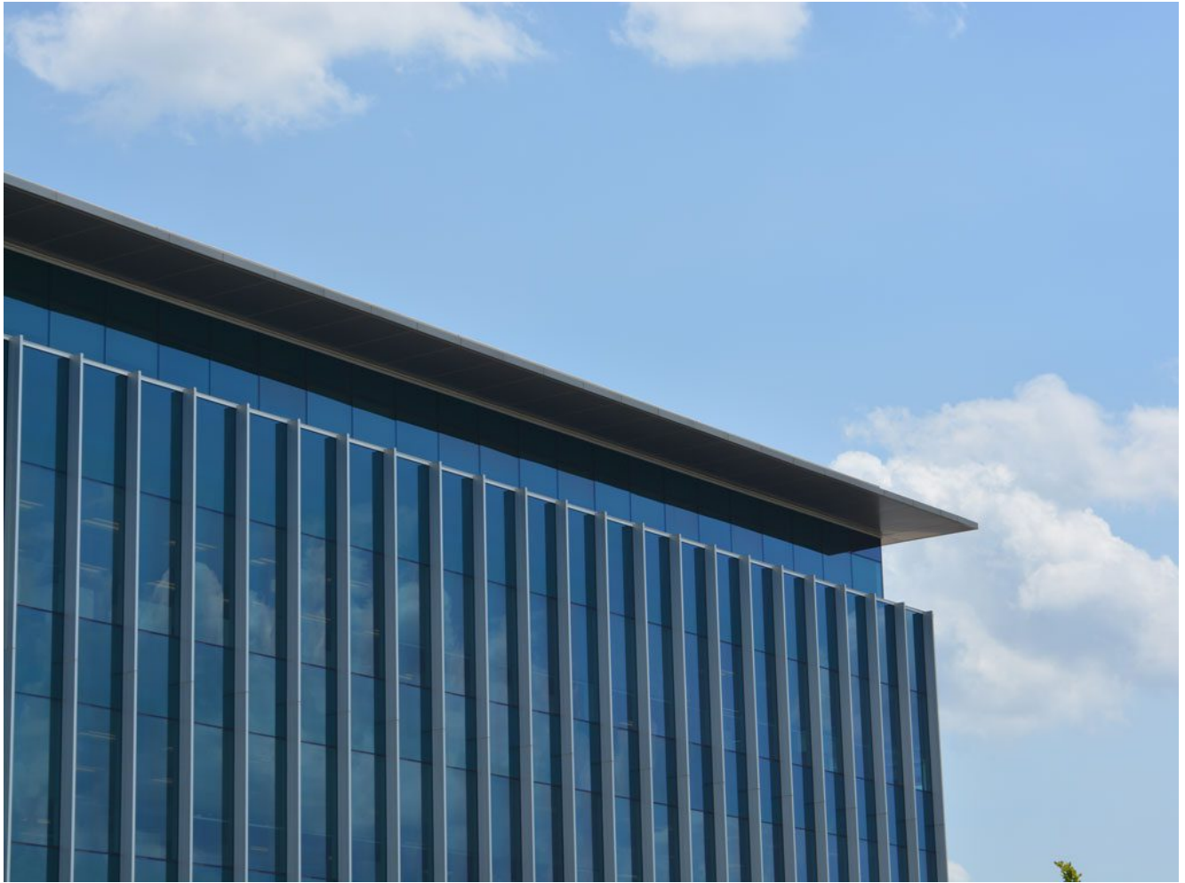
low e insulated glass curtain wall