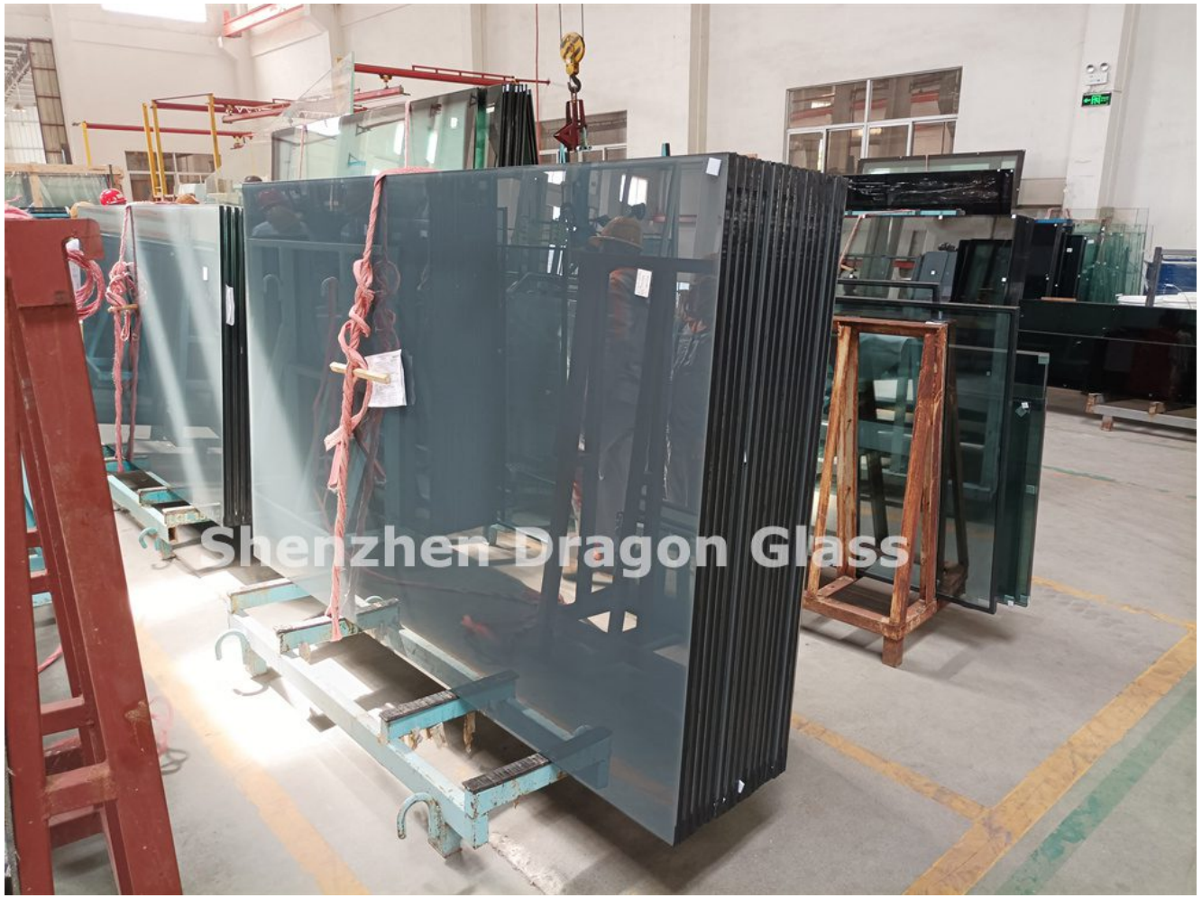
insulated spandrel glass