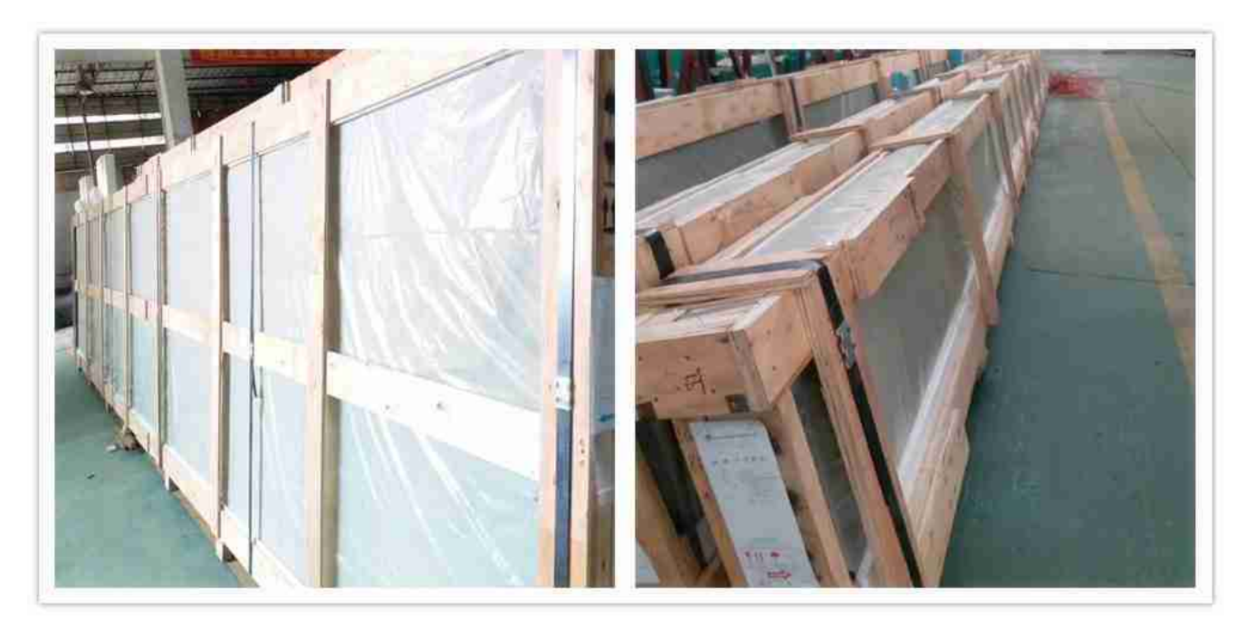
Strong packing for glass delivery safety.