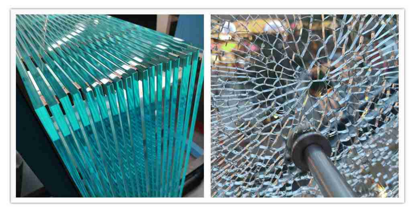
Tempered glass breakage will shatter into small particles which is harmless to humans.

Low iron tempered glass has over 5 times strength higher than normal low iron float glass, with tempering stress over 90Mpa, and can endure strong impact without breaking, even when broken due to extremely high impact, the tempered glass will shatter into small pieces with obtuse angles which will do no harm to humans.