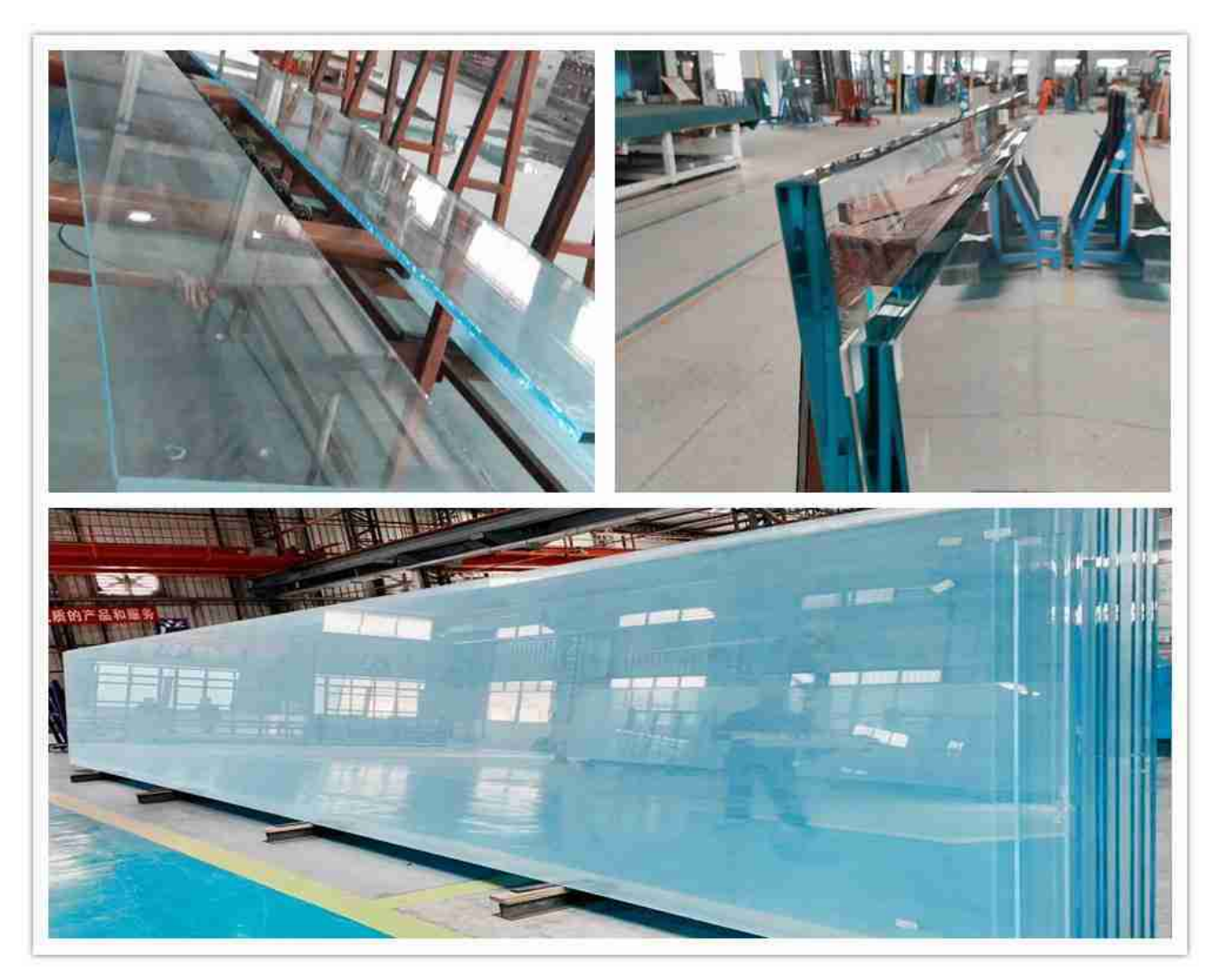
Low iron tempered glass for lobby & facade fins.

Super flat surface with no bubbles, no chips, no scratches or flaws, making sure the tempered glass products with great quality before delivery and shipping.