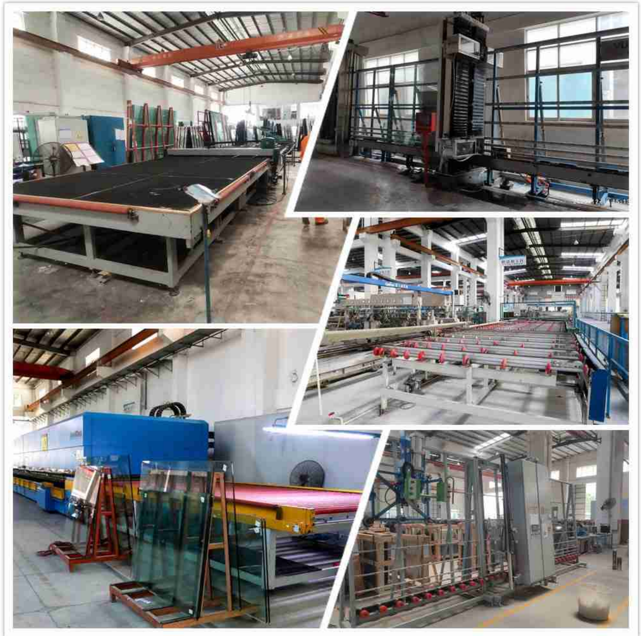
Shenzhen dragon glass machines