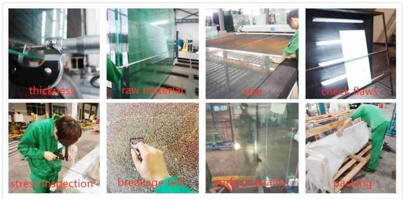
Quality control for tempered glass panels for pool fencing.