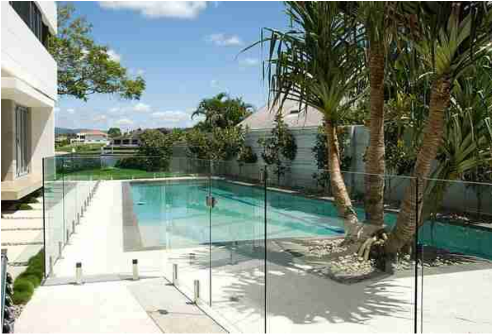
Glass fencing for pools