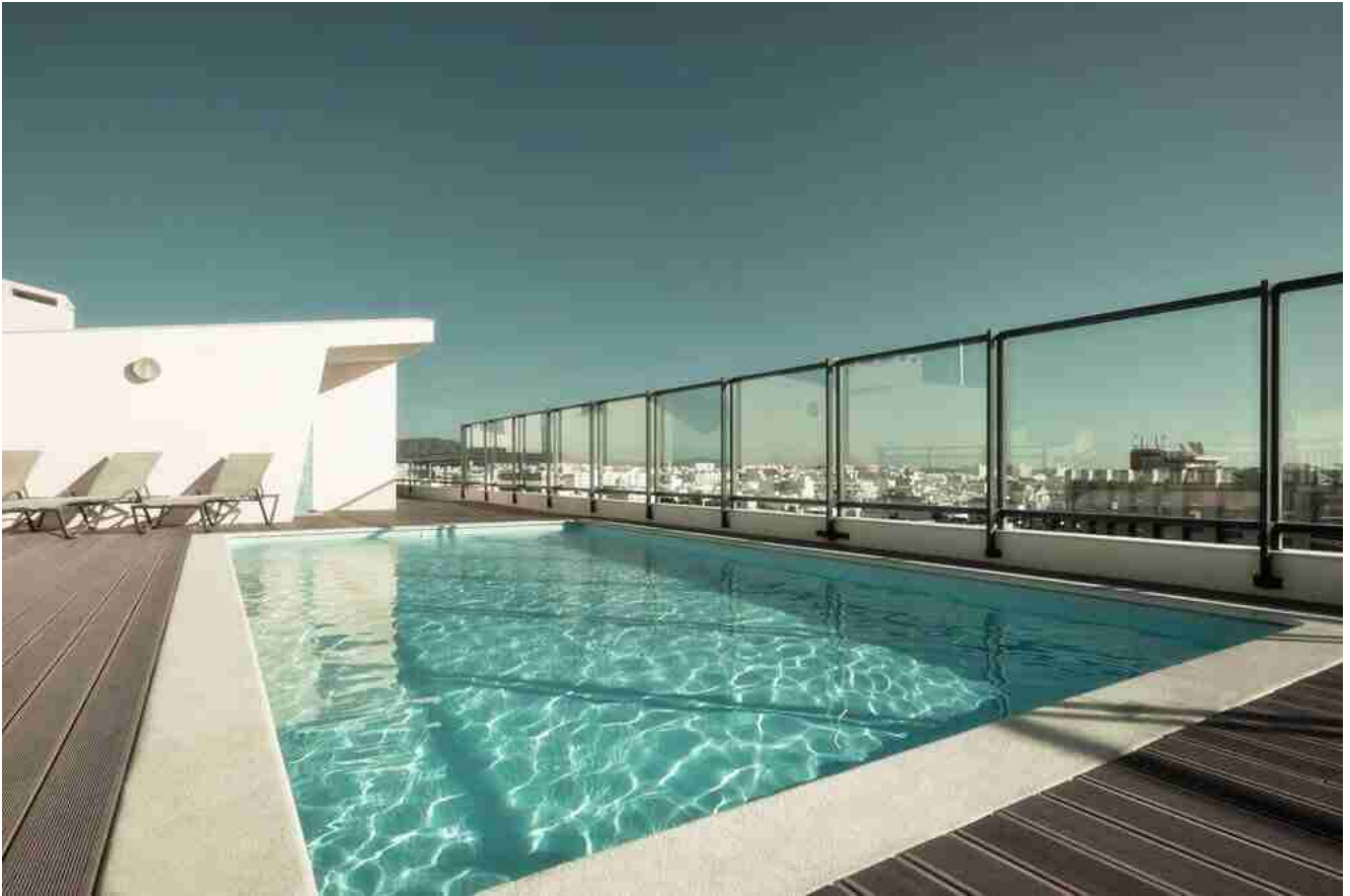
Glass for pool fencing