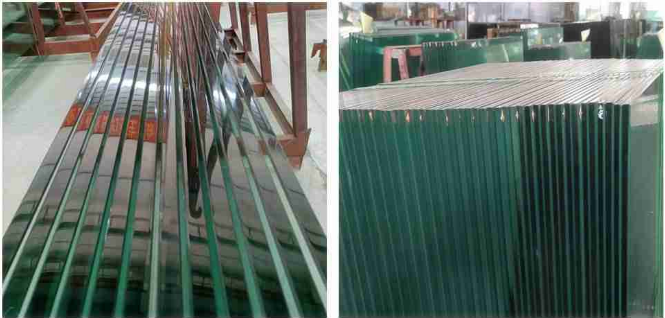
Tempered glass vs laminated glass panels for pool fencing