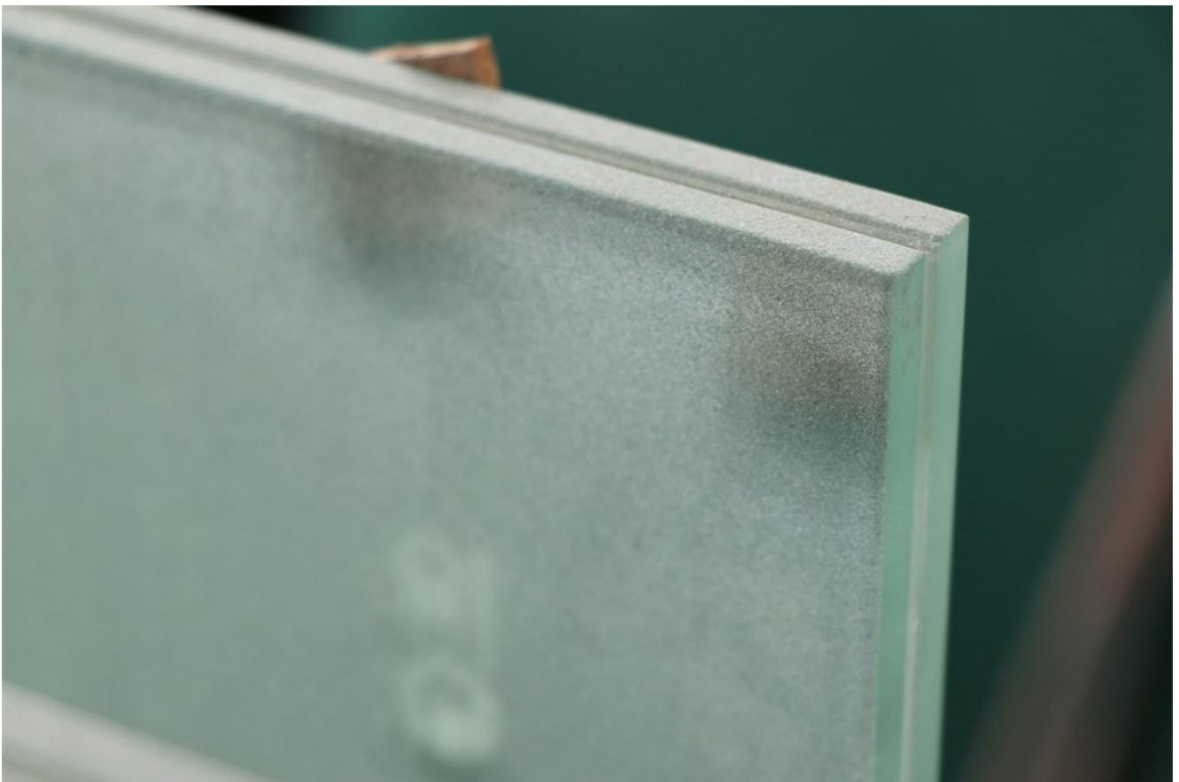
sandblasted laminated glass