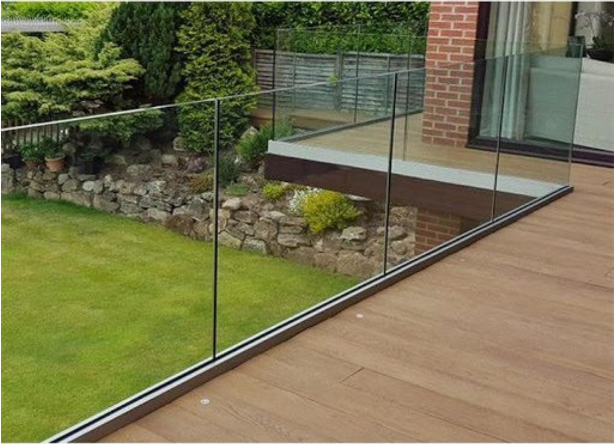
modern balcony glass railing