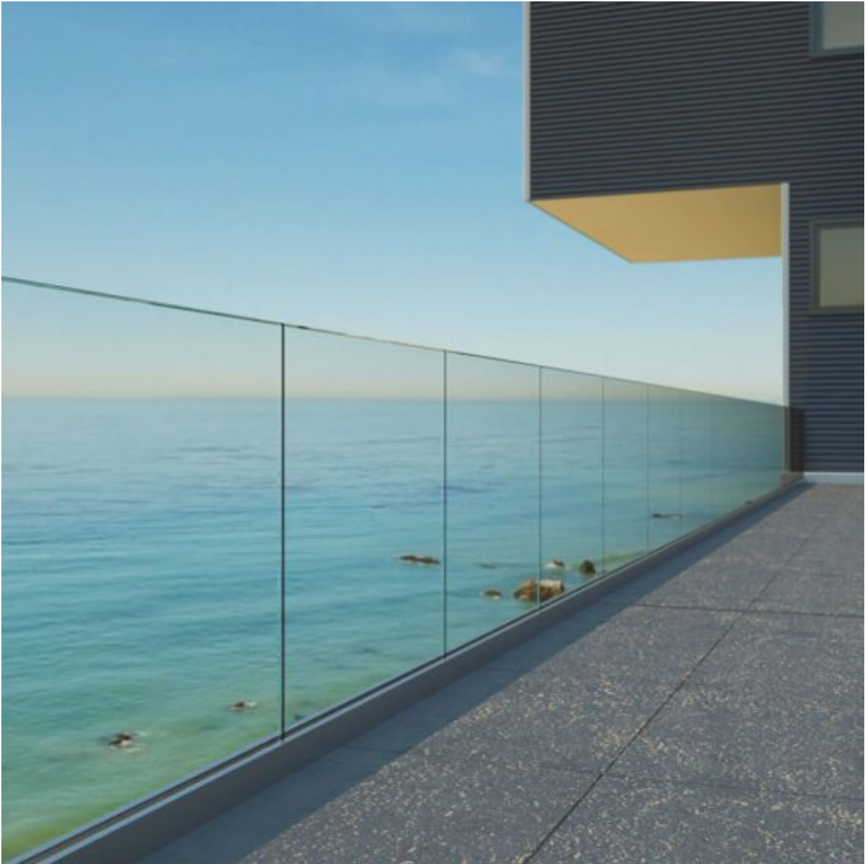
aluminium glass railing by the sea