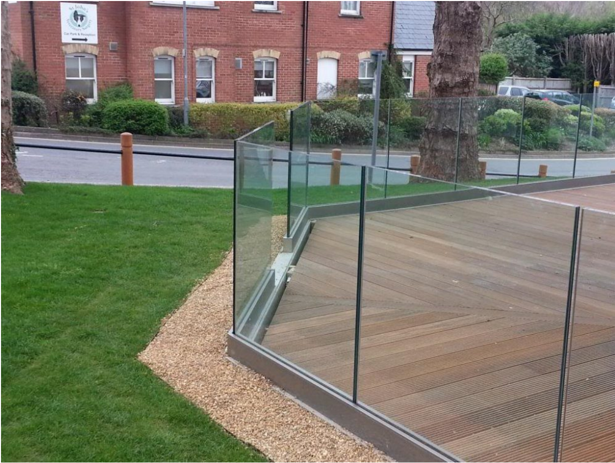
aluminium glass railing for yard fence

Shenzhen Dragon Glass is one of the leading glass railing manufacturer, dedicated to producing kinds of high quality full glass railing. Please contact us today for free inquiries and the best offer.