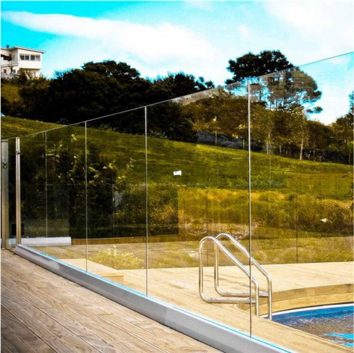
aluminium glass railing for fence