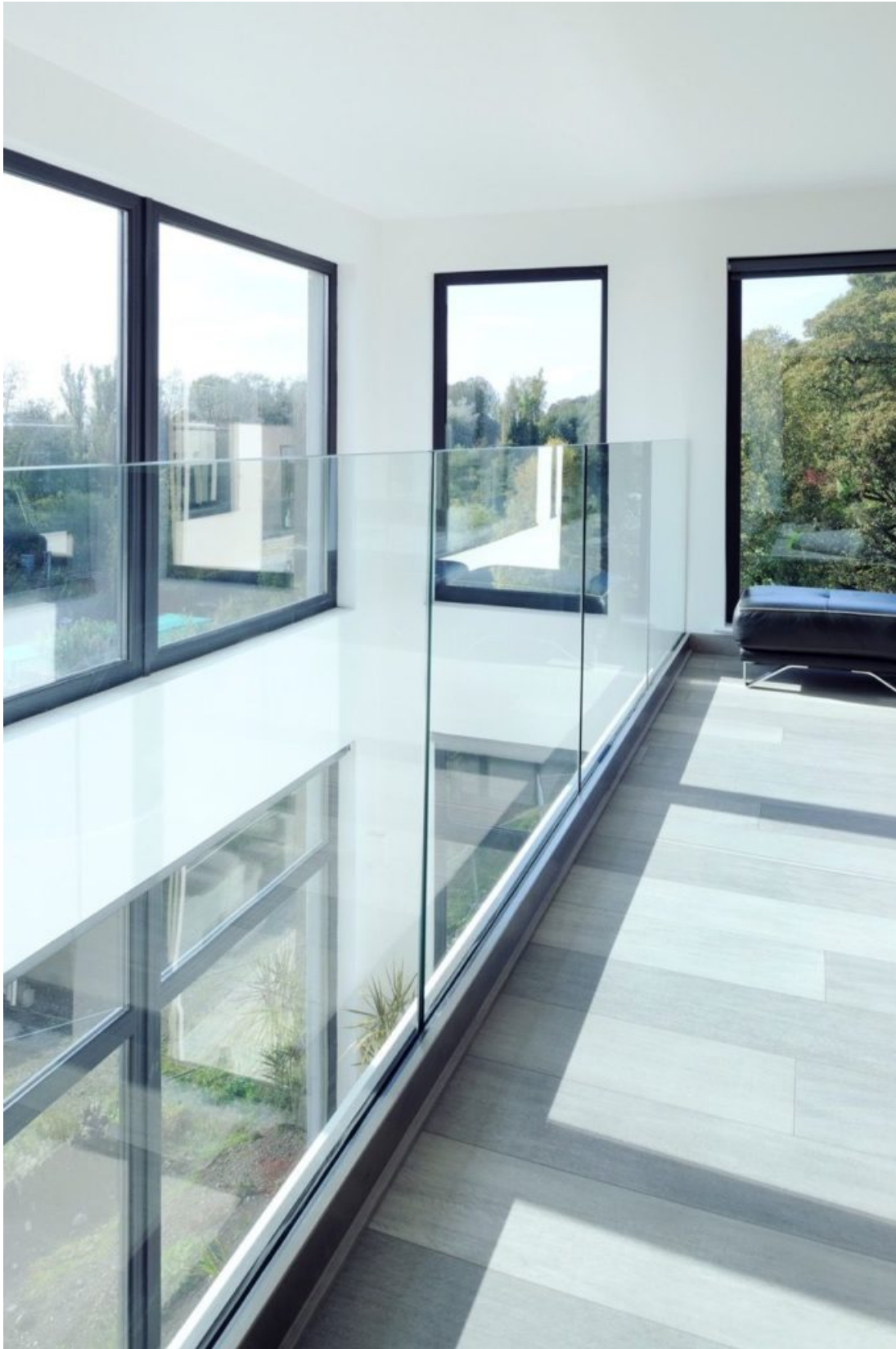
frameless aluminium glass railing