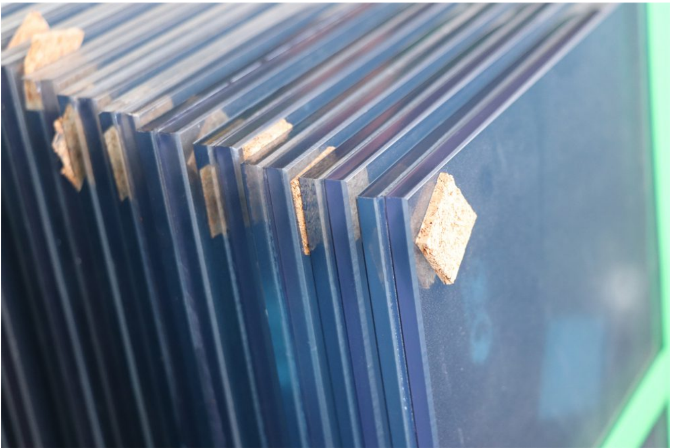
blue laminated glass