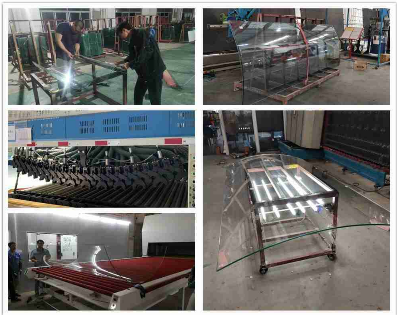
Shenzhen Dragon Glass curved glass production details

The curved toughened glass manufactured by Shenzhen Dragon Glass has more than 5 times higher strength comparing to normal float glass. This is achieved by subjecting final size, edgeworked glass panels into a toughening machine which heats up to 700-degree temperature and bent to due radius and arch then cool down rapidly by strong wind jet to form a compression on the curved toughened glass surface whereas the interior is still in tension. This thermal treatment makes the curved toughened glass strength raise completely to 5 times more than normal glass.