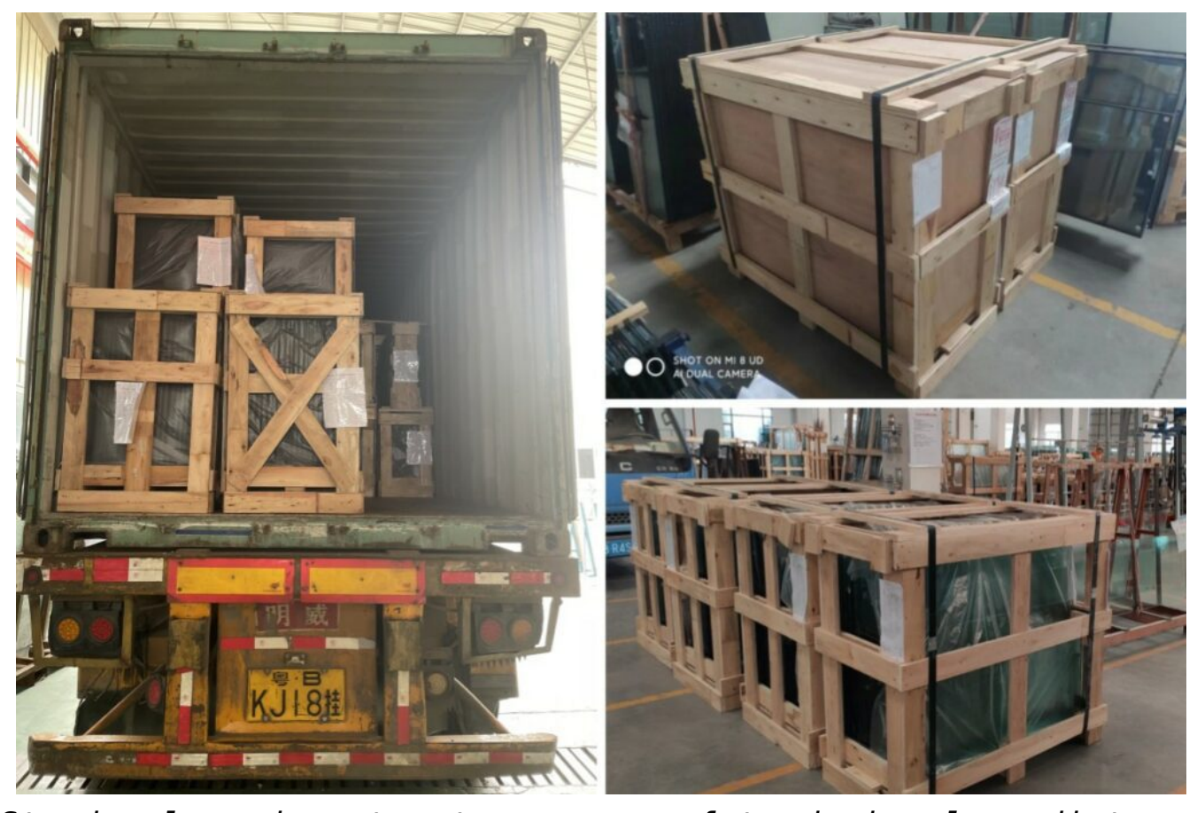
Sturdy plywood crates to ensure safety during long-distance transportation

We <u>Shenzhen Dragon Glass</u> are a glass balustrade manufacturer, we supply all types of curved glass balustrades for both domestic and commercial properties. If you are interested, then please let me know and I can send you our glass solution and how we can help you create beautiful, safe spaces with glass balustrades.