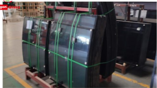
Different kind of Low E IGUs panels