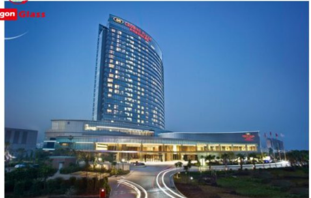
Low E DGUs projects of Dragon Glass